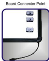
Board Connector Point